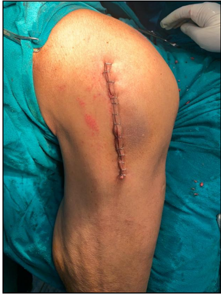
Fig 2: Post-operative

Pre-operative (figure-1) and post-operative (figure-2) of the direct lateral approach