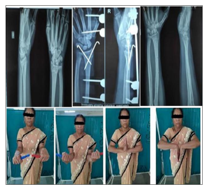
Fig 3: Pre-operative, post operative X-ray with functional outcome of a 52/female with AO type C-1 Distal end radius fracture