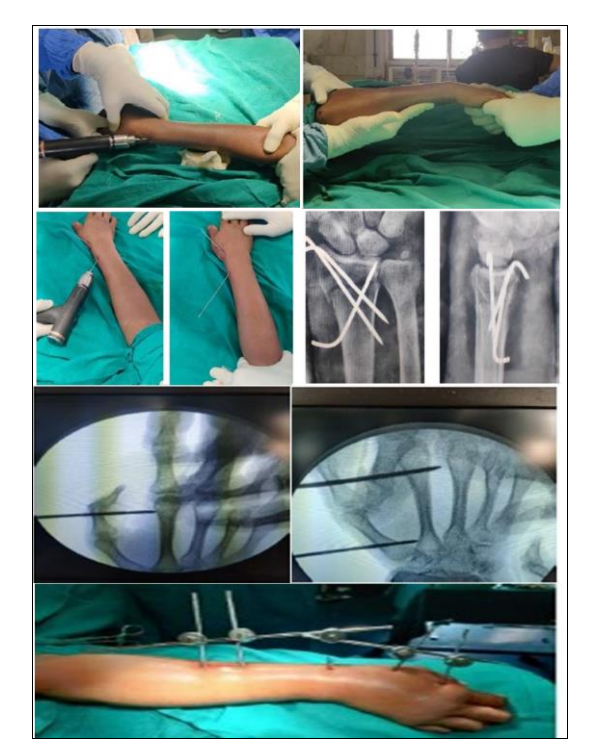
Fig 2: Pin insertion technique with final image

Under fluoroscopic guidance, first of all primary reduction is achieved with traction and manipulation of fracture, which is then fixed with K-wires. After this, 2 schanz pins of 3.5mm are passed through radius and 2 schanz pins of 2.5mm are passed, one through 2<sup>nd</sup> and 3<sup>rd</sup> metacarpal neck and other through the base of 2<sup>nd</sup> and 3<sup>rd</sup> metacarpal. These schanz pins are then fixed with connecting rods via aesculap clamp with joint in appropriate distraction. The position is usually kept such that reduction is maintained. Regular pin tract dressing is then done and antibiotics started post-operatively. Elbow joint and MCP joints are kept free to mobilize.