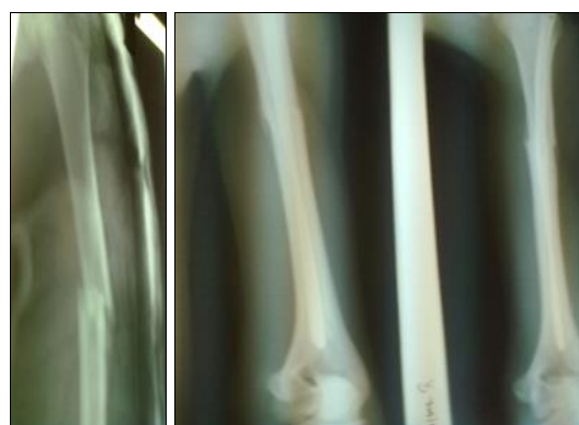
Fig 1: Case 1, Preoperative and postoperative x-ray

Radiographic union was defined as presence of complete osseous bridge across the fragments in both AP and lateral view. In our series, all except three patients showed union in expected time (10 -12 weeks). In two patients union was delayed and was observed at 14-16 weeks. In one case there was non-union and was treated by open reduction and internal fixation with dynamic compression plating along with bone grafting. Pain was found to be most common complication (n=4, 13.33%).Need for second surgery was observed in only one patients (3.33%) cases. There were no intraoperative complication i.e. neurologic or vascular. We had 27 Excellent, 02 Good and 01poor results in our series (p value <0.001).