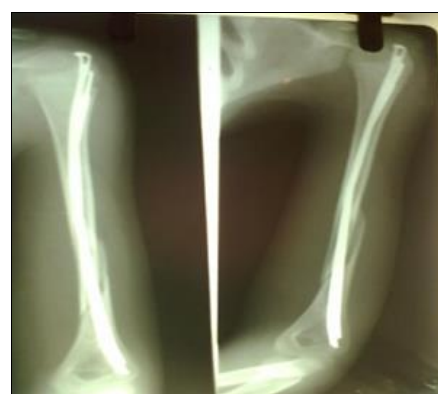
Fig 2: Case 2, Postoperative X-ray