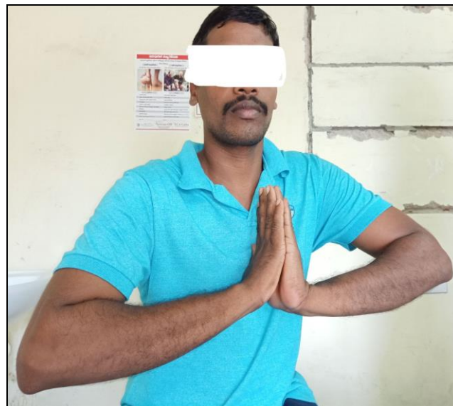
Fig 9c: 6th month followup