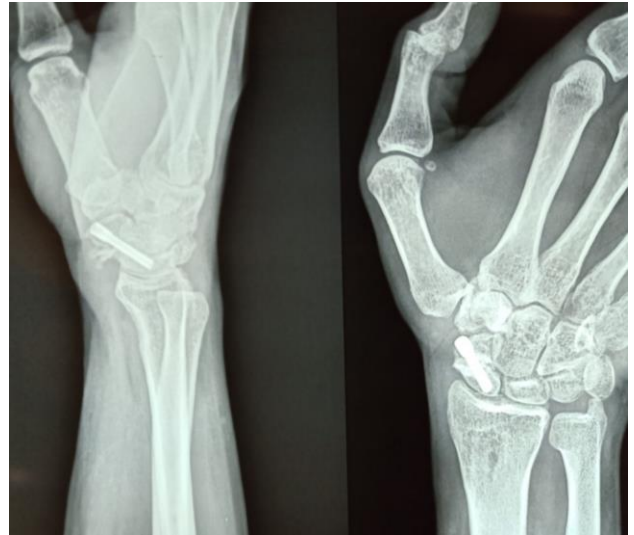
Fig 7: 6th month follow up xray showing donor site healed state and fracture progressive union features.