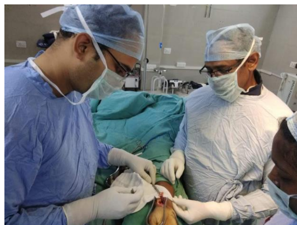
Fig 3b: Surgeon holding the square bone block with attached pronator quadratus muscle belly harvested from volar distal end radius