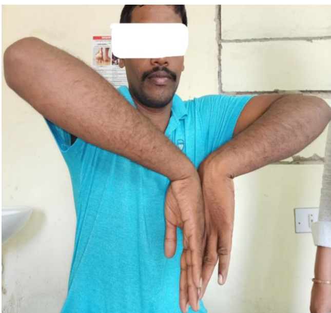
Fig 9b: 6th month followup