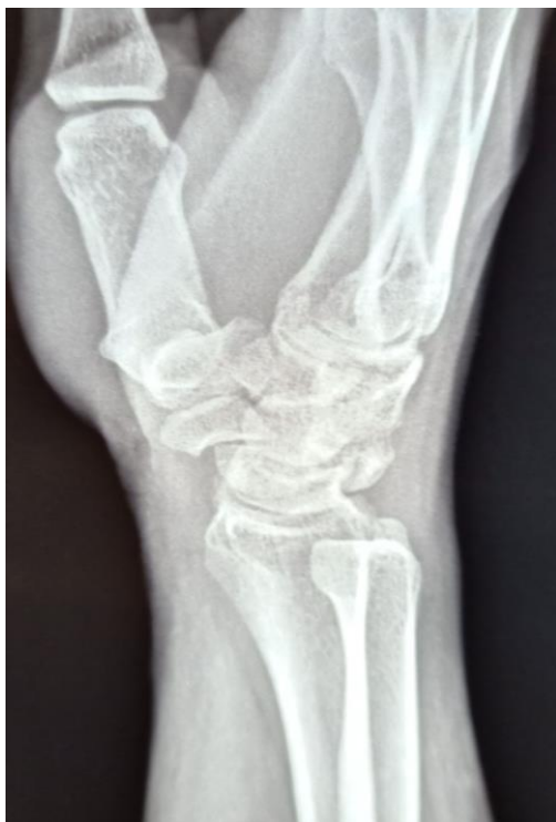
Fig 5: Pre Op Lateral xray of nonunion waist fracture of scaphoid