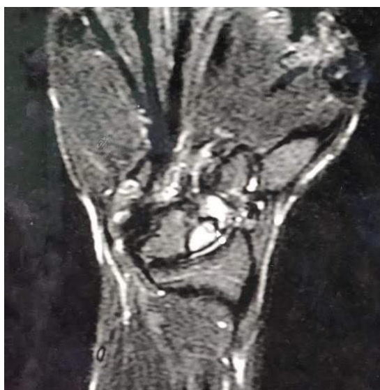
Preoperative MRI showing Cystic degenerative changes along with Nonunion of scaphoid fracture

We evaluated all subjects with standard radiographs of both wrists with postero-anterior views in neutral rotation, lateral views and special scaphoid views. The presence of an avascular proximal pole, dorsal intercalated segmental instability, radioscaphoid arthritis or dorsal osteophytes was noted. MR imaging was done for all subjects for the assessment of the vascularity of the proximal pole.