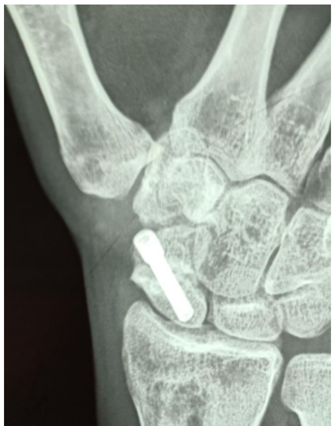
Fig 8: 9th month follow up showing continuity of trabecular pattern.