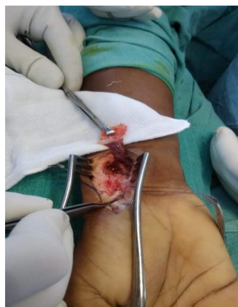
Fig 3a: Surgeon holding the square bone block with attached pronator quadratus muscle belly harvested from volar distal end radius

The surgery was done through a palmar approach ( Extended volar approach) for all subjects. Once capsulotomy was done and scaphoid exposed the proximal and distal parts of the bone were curetted of sclerotic bone and fibrous tissue at the nonunion site using a dental burr. Then a small square block of bone was marked at the insertion of Pro Quad muscle on the radius and was elevated from distal border of the muscle taking 25% of muscle belly. Through temporary over-distraction facilitated by the joystick K-wires, the graft is interposed at the nonunion site, with particular care to correct the length and the rotational malalignment of the nonunited scaphoid. The bone graft was then secured with two 0.8 mm K-wires, one of which extends into the lunate. Under fluoroscopic control in two planes the optimal alignment of the scaphoid was ensured. Once satisfactory reduction was ascertained, length of the screw was calculated and drilled appropriately over a guide wire and Herbert screw was placed.