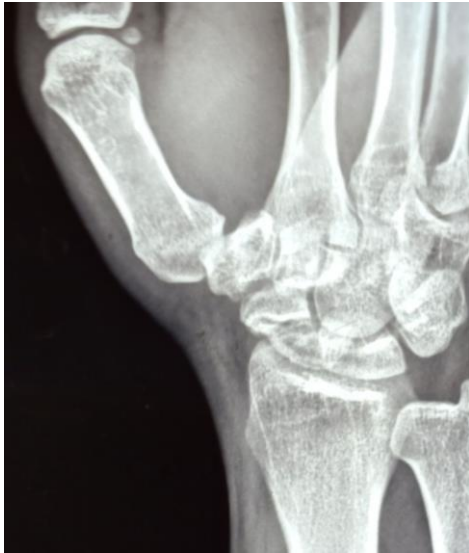
Fig 4: Pre Op AP Xray showing nonunion waist fracture of scaphoid