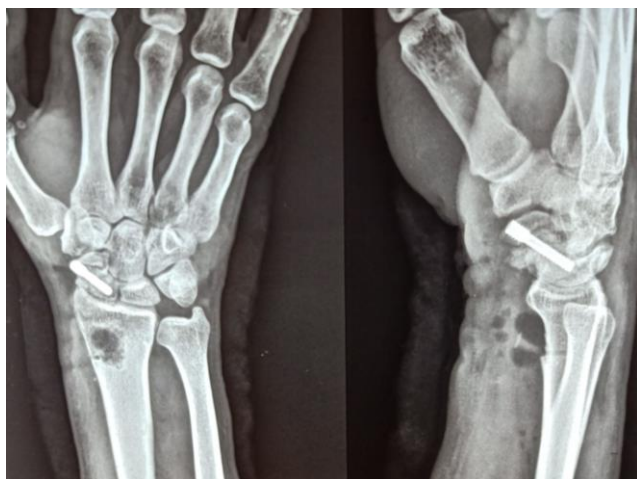
Fig 6: Immediate Post op Xray showing Graft packed at fracture non union site and stabilized with herbert screw.

Postoperative care A long arm cast with thumb spica is applied postoperatively. The K-wires are removed 5 weeks after the procedure and the hand is immobilized in a short arm cast for an additional period of 2–5 weeks