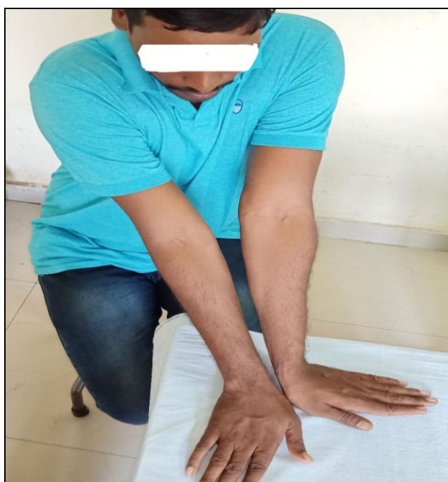
Fig 9a: 6th month followup

Sixmonths after surgery, mean Mayo Wrist Score was 73.0 \pm 8.36 in all the subjects, ranging from 65 to 85. Two subjects (20%) were grouped as excellent, 4 (40%) good and 4 (40.0%) satisfactory.