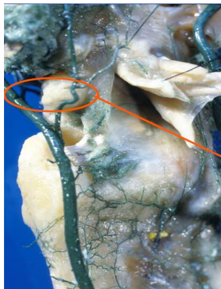
Fig 2: Retrograde supply of scaphoid from a branch of radial artery