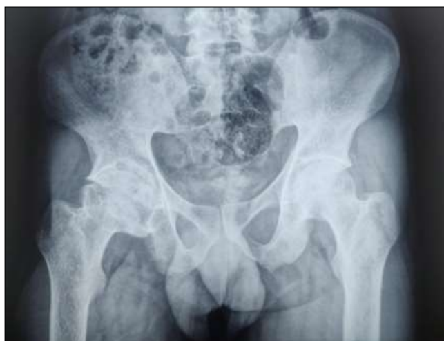
Fig 2: X-ray after 2 years