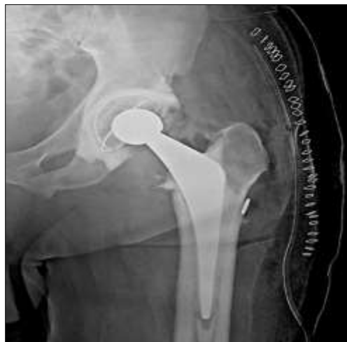
Fig 6: Left Side THR