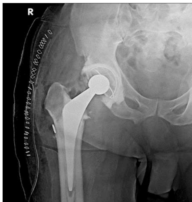
Fig 5: Right side THR