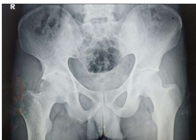
Fig 1: Initial x ray of patient