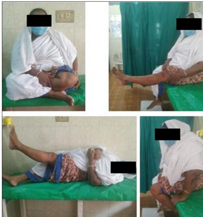
Fig 5: Post injection range of movements