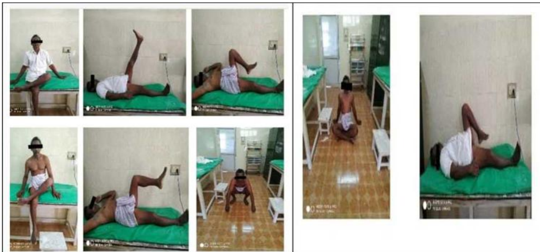
Fig 3: Post Injection range of movements