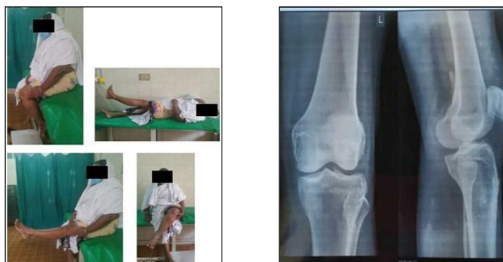
Fig 4: Pre Injection range of movements