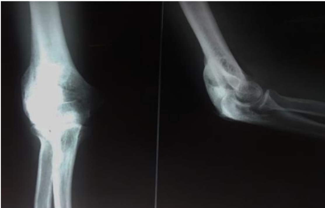
Fig 2: Pre-operative radiograph of right elbow AP and lateral views taken just before surgical procedure (14 months after tetanus infection).