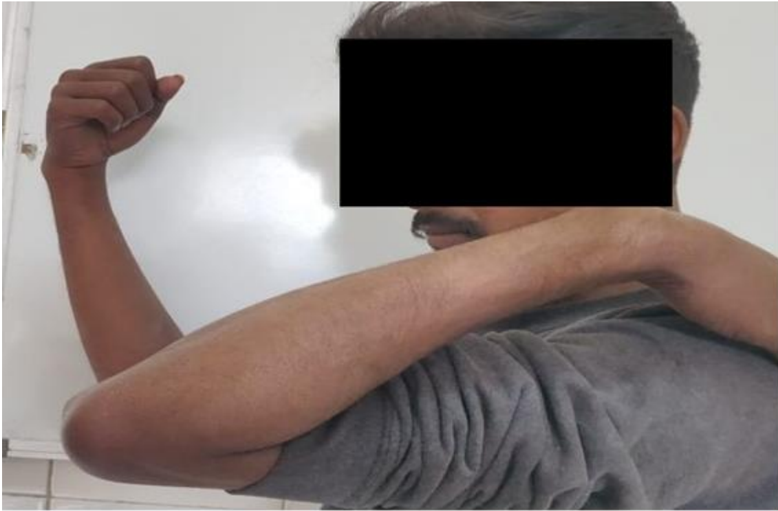
Fig 5: Pre-operative clinical image of right elbow showing flexion upto 80°.