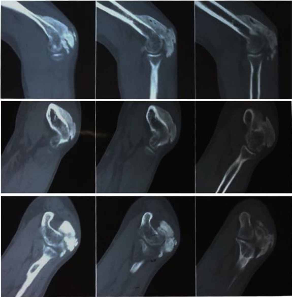
Fig 3: Computed Tomography image of right elbow showing mass arising from the posterior aspect of humerus