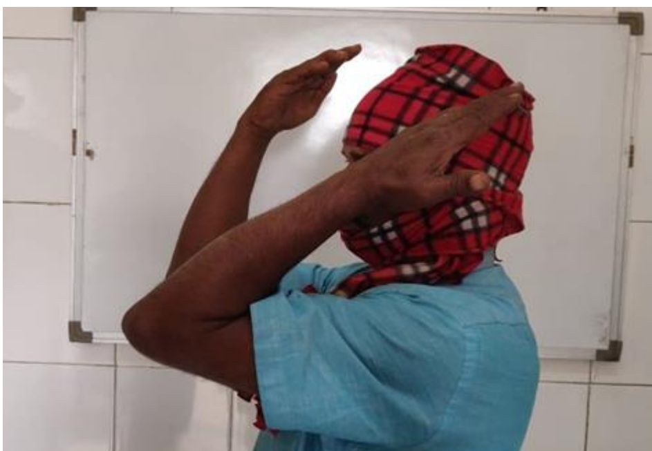
Fig 9: Post-operative clinical image taken after 6 months post-surgery showing flexion upto 120^{\circ}