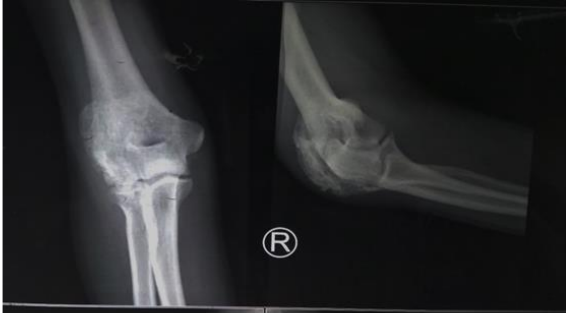
Fig 1: Pre-operative radiograph of right elbow AP and Lateral views taken 2 months after tetanus infection showing ossification arising from posterior aspect of humerus extending upto olecranon

myositis mass was found over the posterior and lateral aspect of distal humerus extending onto olecranon. Excision of the myositis mass and arthrolysis of elbow joint was performed. Full range of flexion and extension was achieved on table. Excised mass was sent for biopsy. Biopsy showed zonal phenomena with central cellular area, intermediate zone of osteoid and peripheral shell of highly organized bone confirming myositis ossificans.