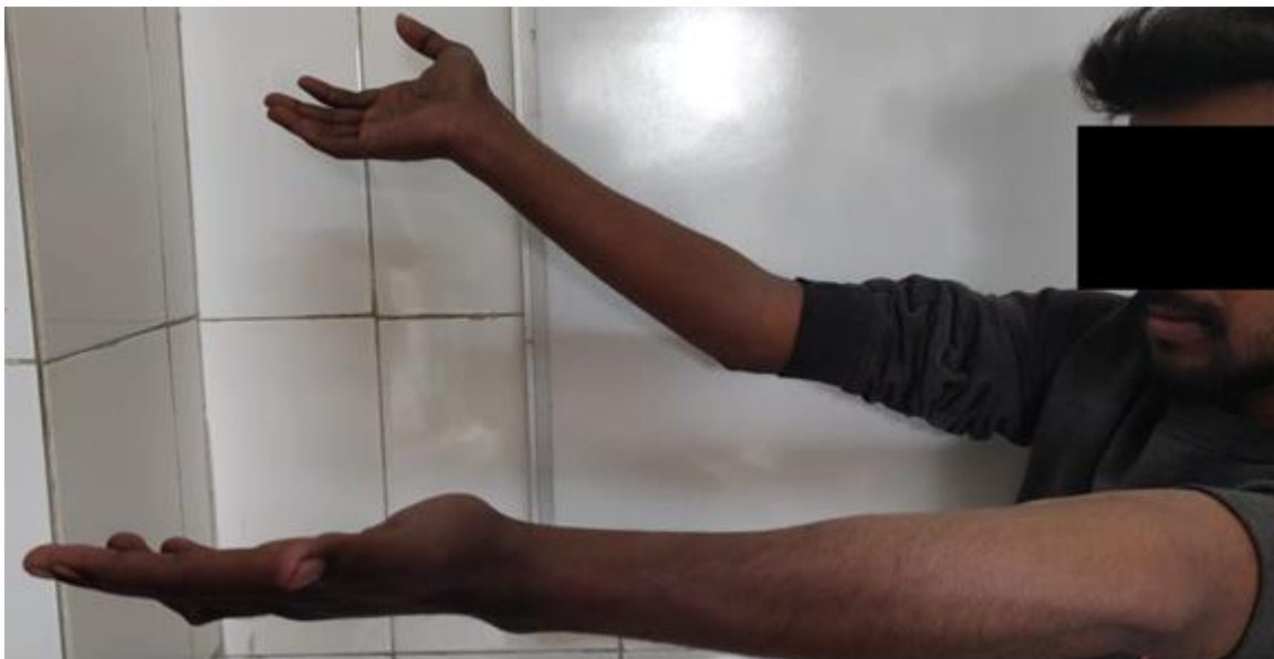
Fig 4: Pre-operative clinical image of right elbow showing 25° of flexion deformity.