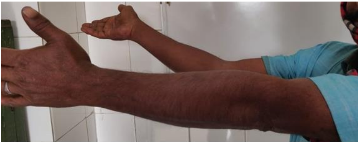
Fig 8: Post-operative clinical image taken 6 months post surgery showing residual flexion deformity of 15^{\circ} .

suture removal in consultation with the physiotherapist. The patient was followed up and achieved a range of motion of flexion deformity of 15^{\circ} with further flexion upto 120^{\circ} .