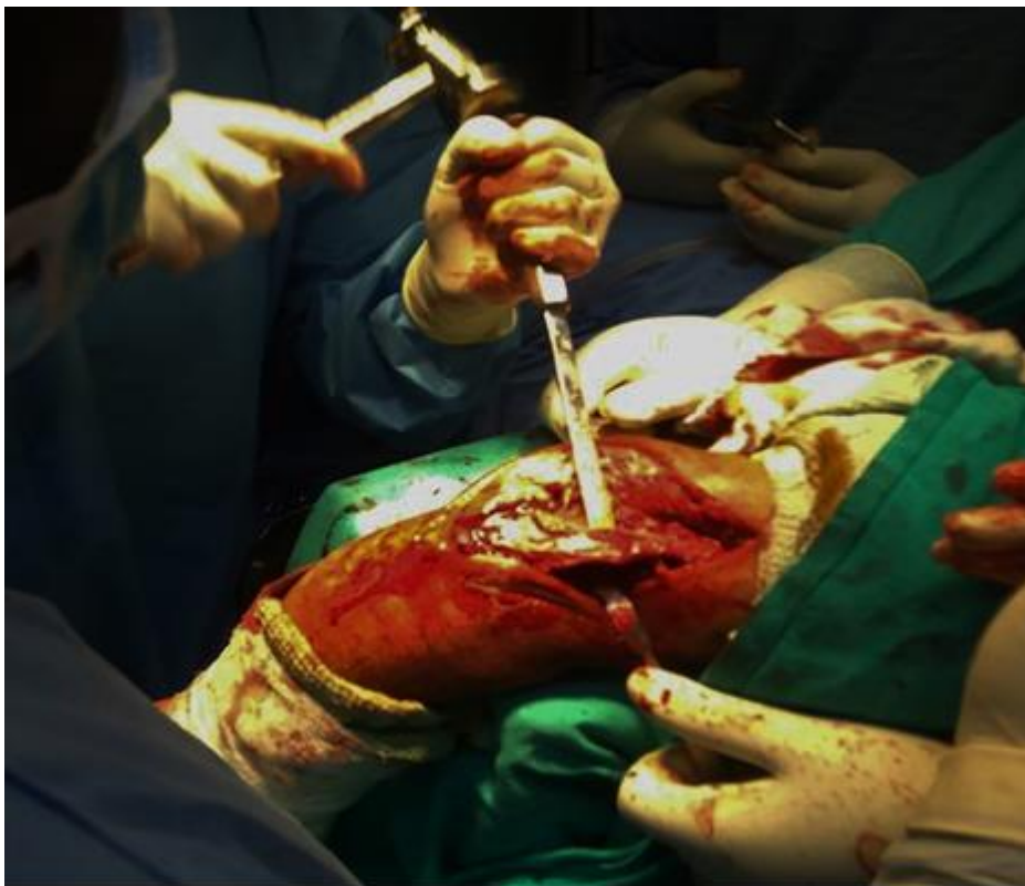
Fig 6: Intra-operative picture showing excision of myositis mass from posterior aspect of distal humerus.